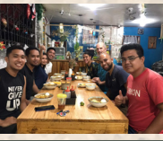
Off to the northern islands